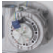
Gear box protection (hall effect)