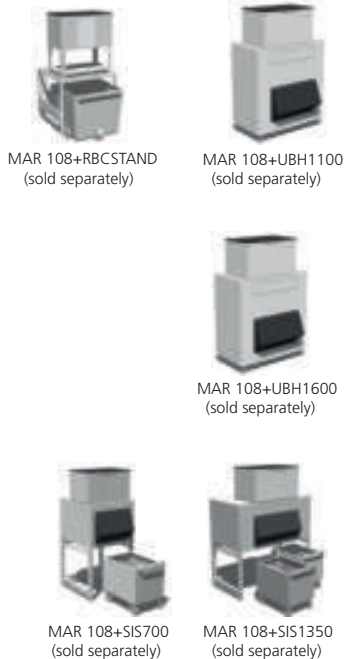
MAR 108+RBCSTAND (sold separately)