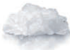
Residual humidity content 15%

Super-flake ice, extruded just below 0° Celsius, retains only 15-18% of residual umidity, making it relatively dry and compact.