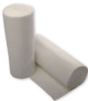
Lava Fluid Stop Art.No. VL0002