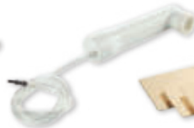
Lava Container-Adapter Art.No. VL0093