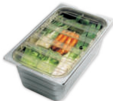
SB / Stainless Steel Container from Art.No. VL0040