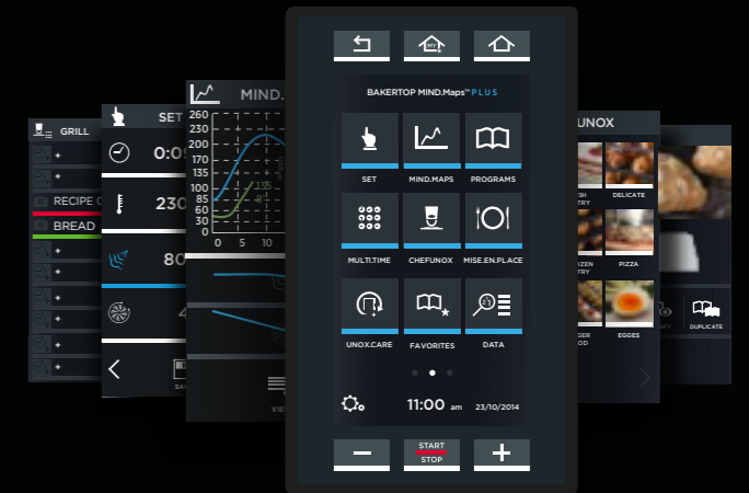
MASTER.Touch PLUS Interface

With the PLUS version you have all the technological power of MIND.Maps™ in an interface that has even more space. A creative experience without limits that you cannot wait to repeat.