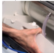
Easy to remove water sump