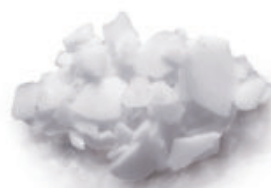
Residual water content 2%

Ice scales are the coldest form of ice. Formed at -6° to -12°Celsius, they are very dry, containing less than 2% residual water. Scales look like fragments of glass, have an irregular shape and a thickness that can be adjusted at 1 or 2 mm.