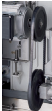
Pulleys & belt system allows to modify ice thickness