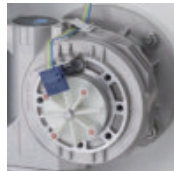
Gear box protection (hall effect)