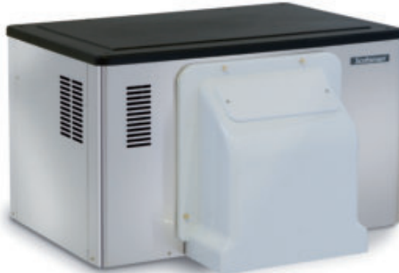
ABS Ice Chute Cover: sold separately.