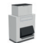
MAR 78+UBH1100 (sold separately)