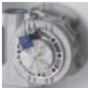
Gear box protection (hall effect)