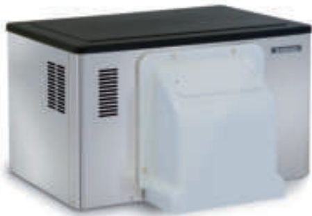
ABS Ice Chute Cover: sold separately.