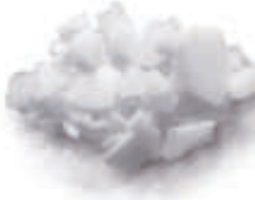
Residual water content 2%

Ice scales are the coldest form of ice. Formed at -6° to -12°Celsius, they are very dry, containing less than 2% residual water. Scales look like fragments of glass, have an irregular shape and a thickness that can be adjusted at 1 or 2 mm.