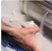
Easy to remove water sump