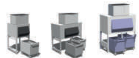
MAR 128+SIS700 (sold separately)